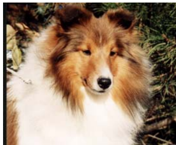
May I always be the person my dog thinks I am