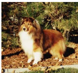
She showed us some innovative way's to make the most of our dogs!