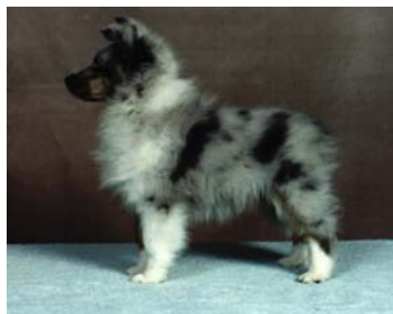
Aren't they all winners??

We'll see you all there with bells on!!! Please check the premium for further details on the show. Don't be late!!