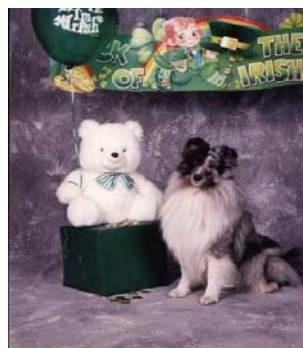
Saltaire Harlequin Romance CD Nov 11, 1989- Mar 17th 2003

His greatest talent was that, no matter where we were, or who he was with, he made even strangers feel like he was 'their' dog. He was truly not only a beautiful example of the