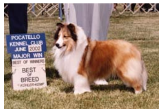
"Shimmer" Best of Breed! Thanks Suzi Beacham!

looking at our pictures, you'll love it too. You send it, I'll print it! Don't be shy!