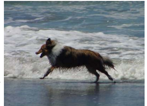
Summer fun in the sun!!!

Oh how we love just kicking back with the dogs and spending time just watching them have a great time. The heat puts the kibosh on some things, but they can be a great help during camping, barking at