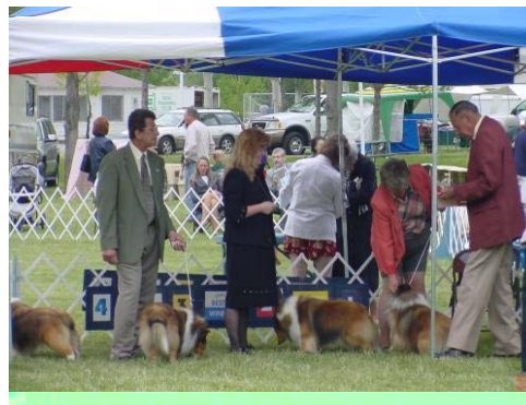
Our Specialty in Logan was very successful! Congratulations to all the winners on both days!

Our luncheon was as expected divine with delicious dishes prepared by our talented club members. So much