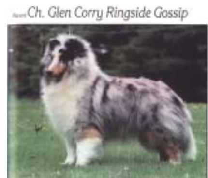
Reserve Winners Bit ch ASSA

We are charter members of the USSA and are very appreciative of all the help and advice we have recieved over the years. After all the wins, plaques, ribbons, and rosettes, and notoriety the bottom line is: SHELTIES, LOVE-THEM FOR US AND US FOR THEM!!!!!!