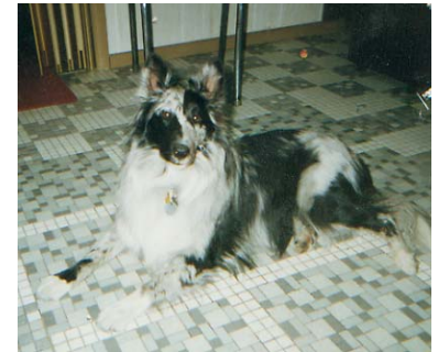
Seems like sometimes it's hard to tell where it all begins and ends!

Our hopes are that each of you will take advantage of