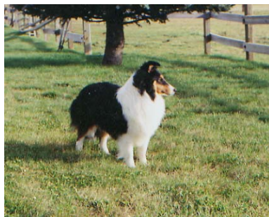
"Danny" Caledon Daffs Dream Maker