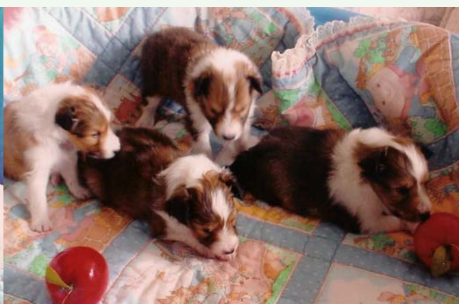
Which way to the Sheltie Club Party, Guys?