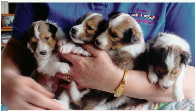
An armful of love to one and all.