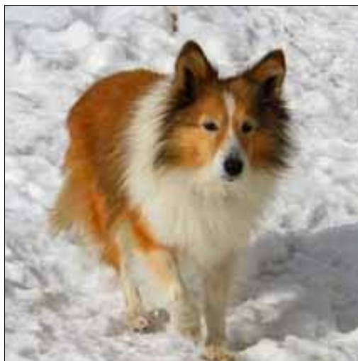
Playful and flirtatious Lily 'coached' Dewey, turning him into a proper Sheltie-boyfriend.