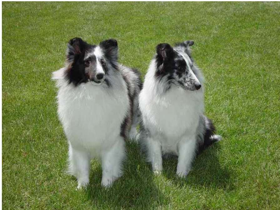
"Annie" and "Stripe"