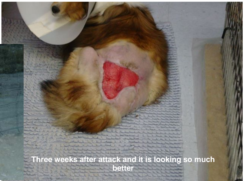
Three weeks after attack and it is looking so much better