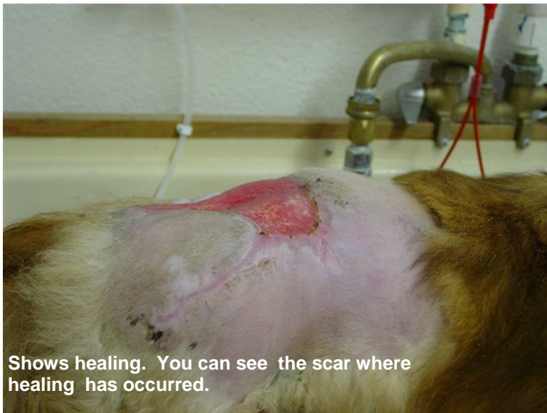
Shows healing. You can see the scar where healing has occurred.