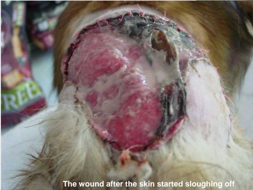
The wound after the skin started sloughing off