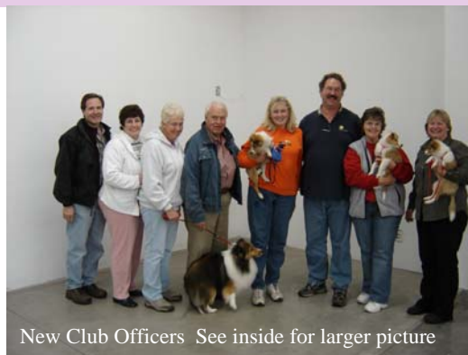
New Club Officers See inside for larger picture