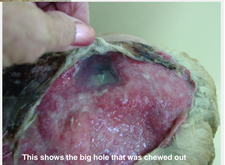
This shows the big hole that was chewed out