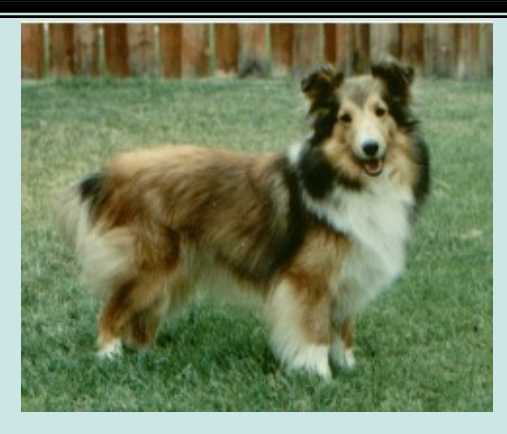
Daydreams Simply Classic "Tracy" 5/15/90-5/31/05

My old girl Daydreams Simply Classic "Tracy" left us on 5/31/05. She was born on 5/15/90. Tracy was the only dog I've ever owned that with the passing of the older dogs never became the Alpha female, she always remained the Omega female. She was my "gentle soul" and was our bedroom house dog until her illness made it impossible for her to remain in the bedroom with us. She passed away from cancer with the assistance of our compassionate Veterinarian. As a young puppy she escaped from the home we had placed her in and traveled up and over a mountain trying to find her way back home. We were lucky enough to be able to find her and I promised her that she would never have to leave our home again. During the time that she was lost it was a particularly rainy night and she remained terrified of thunder and lightning the rest of her life. She could hear it from miles away and would always jump on top of our heads as we were peacefully sleeping and tremble and shake underneath our covers until the storm passed. As she aged it was a particular blessing when she finally lost her hearing and we could sleep blissfully through all those noisy thunderstorms!