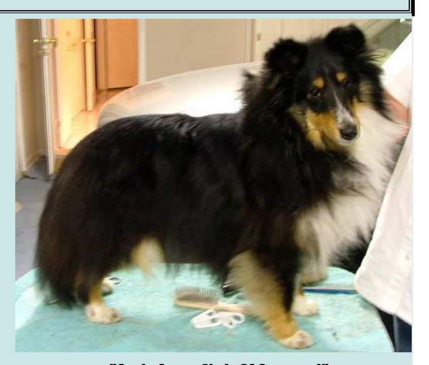
"Apple Acres Chain Of Command" Our first weekend in the ring "Reagan" and I took a second place ribbon at the same show in the 12-18 month old dogs in confirmation.