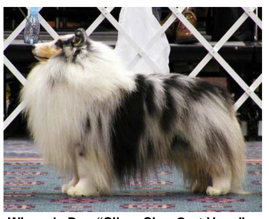
Winner's Dog "Silver Sion Grat Vega"