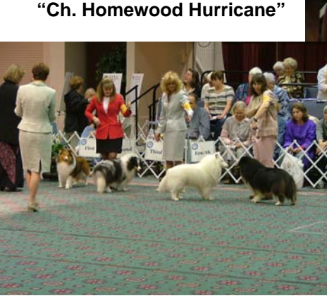
Stud Dog class Winners