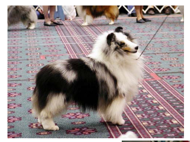
Best of Breed at the National "Ch. Homewood Hurricane"