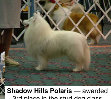
3rd place in the stud dog class

Isn't it fun to see an all white dog in the ring?