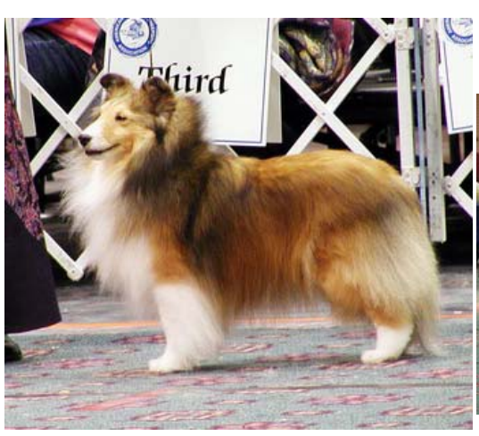
Winner's Bitch "Lynphil's Classy Lil Chassis"