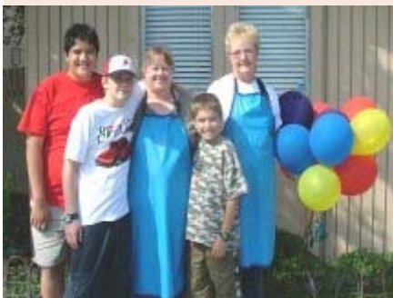
Thanks to those that helped!!!!