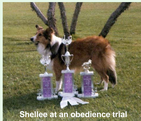
Shellee at an obedience trial