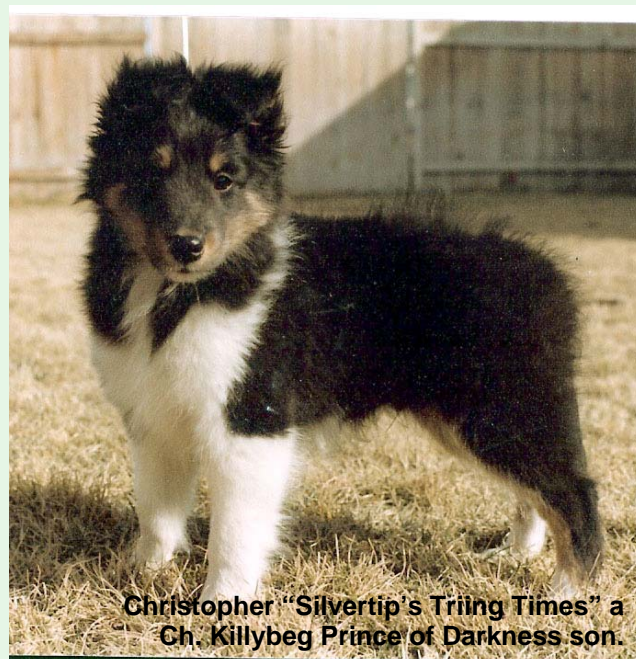
Christopher "Silvertip's Triing Times" a Ch. Killybeg Prince of Darkness son.

In the early days of my "dog life", I was in love with Pow, "Ch. Cherden's Sock It To 'Em". I loved Deep Purple and Backstop. I sent bitches to be bred with Ch. Harvest Hill Shoeshine Boy, and Ch. Killybeg Prince of Darkness. I loved all of these dogs. The Banchory and Summersong dogs had the look I loved, with all that wonderful bone and muzzle. They possessed the chiseled head that I longed to achieve. Today there are so many dogs that I admire that there are too many to mention. I feel like the wonderful dogs are more spread around now than they were years ago. I think that may have come about because those very large