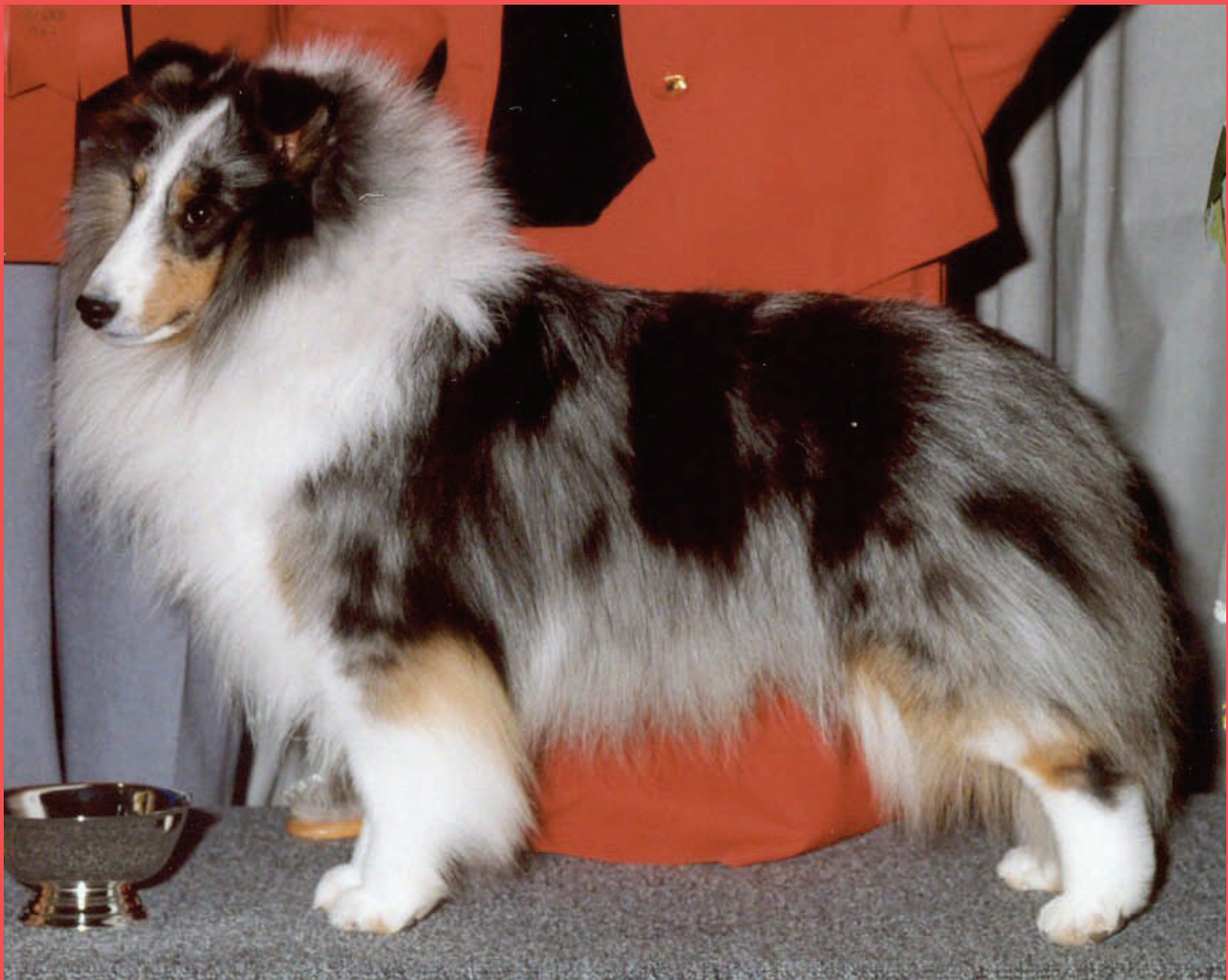
Ch. CharBar's Storm Seeker "Seeker"

Seeker is looking for a forever home. He is a wonderful five year old boy who loves playing ball and has a lot of energy. He is fully housetrained. He is micro chipped and had all of his test done.