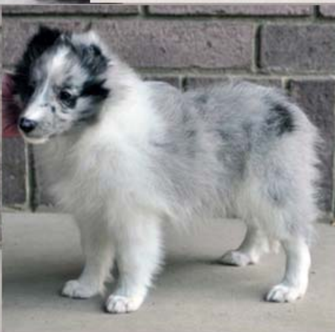
Bi Blue boy show prospects

If you are interested in one of these puppies, contact Cherie Hyde at 801.226.0701 or email at cghyde@comcast.net